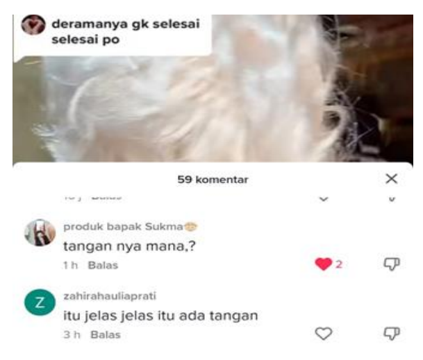
Figure 3. Netizen's comments about the drama