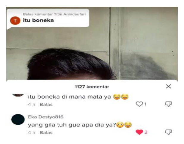
Figure 1. Netizen's comments about dolls