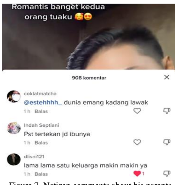
Figure 7. Netizen comments about his parents

Context : OnThe video shows Popo, his mother and a bolster who is given a mask that is recognized as his father showing off the intimacy between his mother and father who are eating together. Then Popo showed his mother feeding his father, and Popo said that they were very romantic.