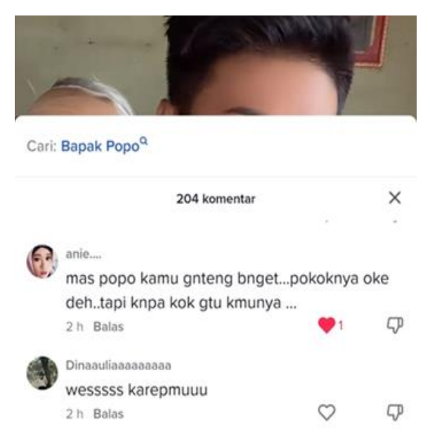
Figure 9. Netizen's comments about her breasts

SNHW : "Keluarganya bilang udah mengikhlaskan, kalo ada hutang hubungi keluarga" Based on the data above, the sentence was uttered by netizens with the initials SNHW. He said a sentence with the aim of satire using double speech. Multiple utterances usually occur because the sentences used are incomplete(Lestar, 2017, pp. 1-11). The sentence that is included in the double speech is the sentence "the family said they have let it go". There are two meanings of the phrase the family has let go, namely the family is letting go of the money, or letting Popo be.