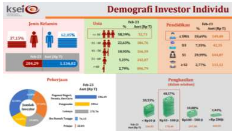
Figure 1. Demographics of Individual Investors

President Director of the Indonesia Stock Exchange (IDX), Iman Rachman, noted that there is a surge in investor growth every year. It can be seen in figure 1.2 the largest number of investors, namely at SMA 59.69% and S1 29.99, this proves that investment interest in young people is quite high. With the existence of the IDX Investment Gallery, it is hoped that it can provide mutual benefits for all parties so that the dissemination of capital market information is on target and can provide optimal benefits for students, especially Jember students, economic practitioners, investors, capital market observers and the general public. The following are campuses domiciled in Jember regency in collaboration with IDX Kap. East Java in the establishment of GIBEI, namely: